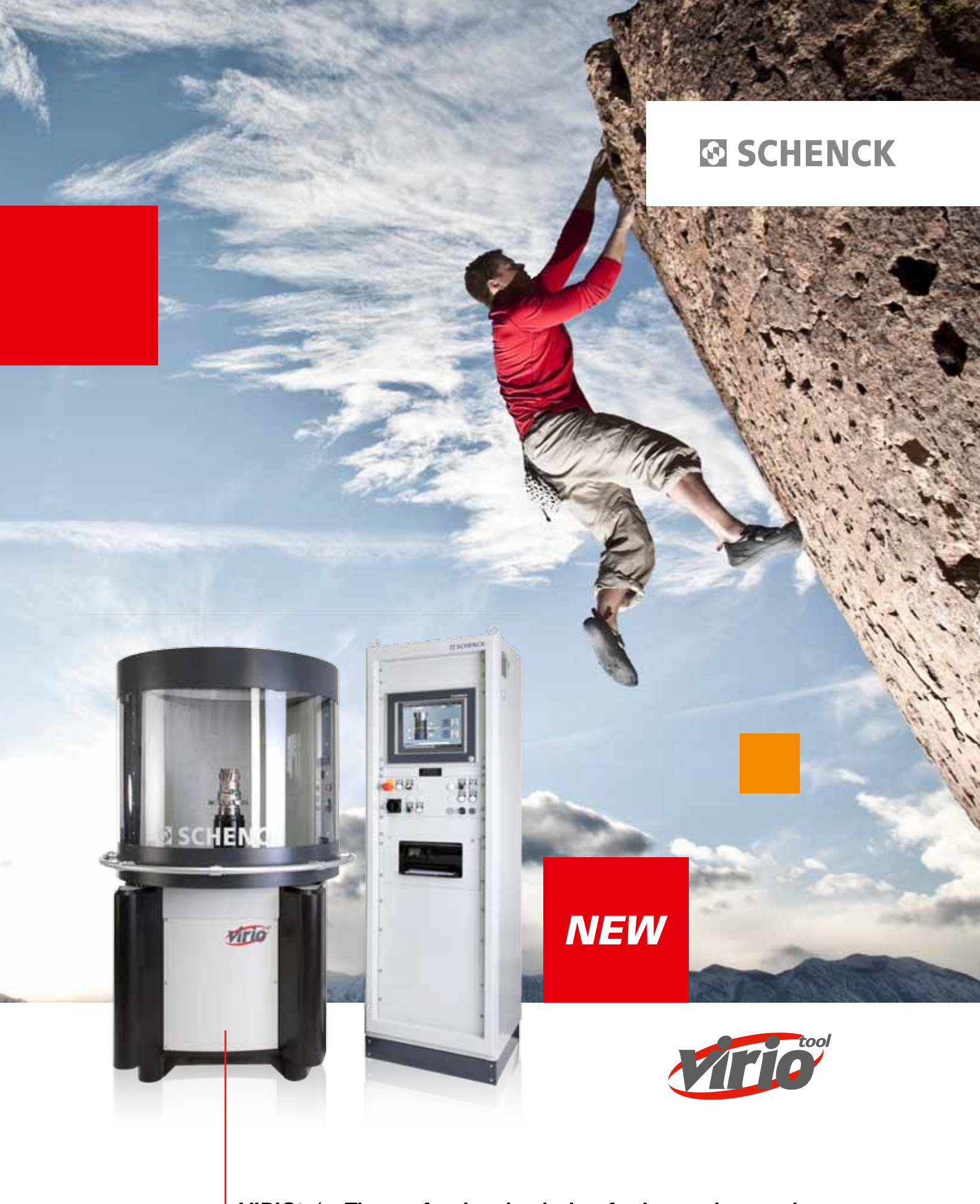
VIRIO <sup>tool</sup> – The professional solution for heavy-duty tools Balancing of tools and tool holders up to 100 kg