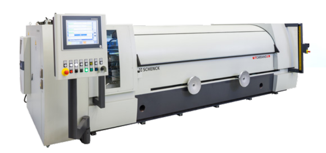
Fast – the sectional safety door cycles very rapidly.

The mix of manual operations and automatic processes is particularly suited for small and mid-size lots and optimizes process reliability during production. This results in shorter cycle times for batch production as well as being ideal for high-capacity maintenance facilities.