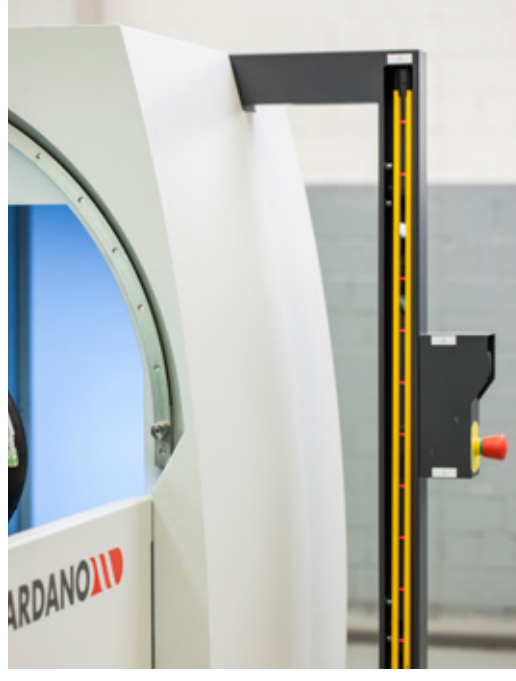
Safety brackets ensure that you are protected even in the event of damage.