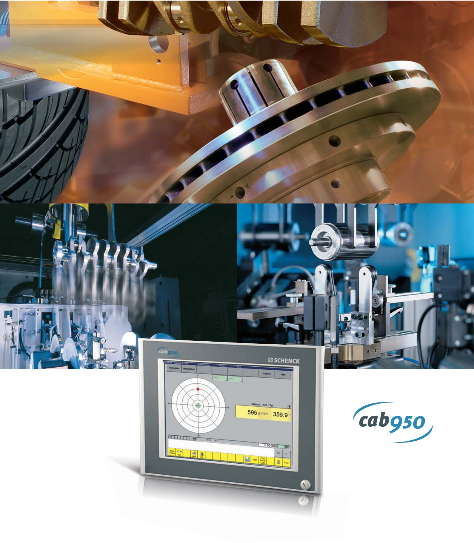
CAB 950 – added value for your production

CAB 950 – the measuring and control unit for balancing in production opens up new possibilities for you. It is the basis for shorter setting up times, maximum stability, flexibility and efficiency and high system availability - far beyond mere balancing. Powerful hardware, easy to understand software and the module, service-friendly design helps you to increase efficiency in the quality relevant "balancing" production step.